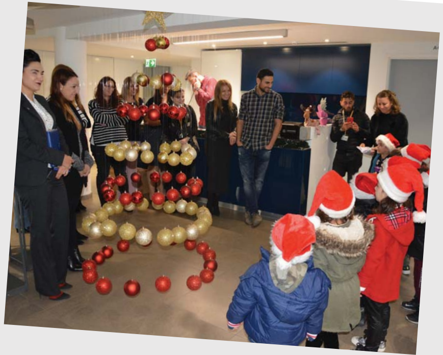
Christmas Carols by our young neighbours, elementary school children