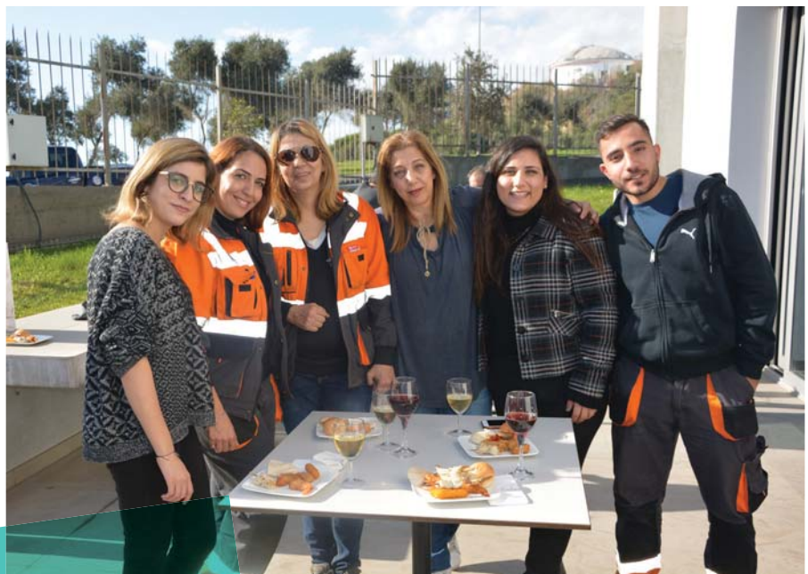
Secret Santa party